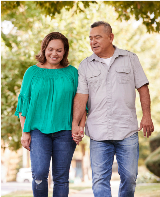
In the Pendar Lane area of Mckennan Park in Sioux Falls.